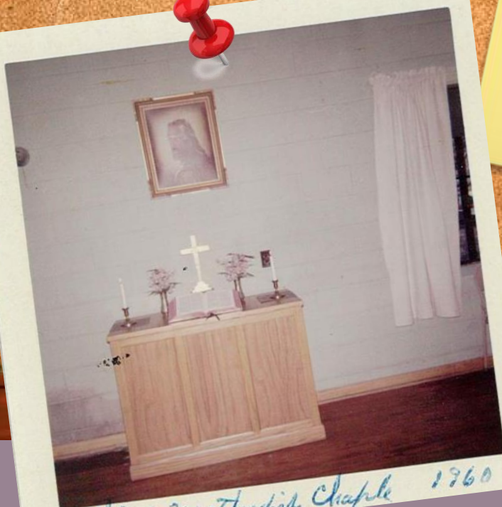
Southport Methodist Chapel 1960

What: Paper Shredding, Appliance Recycling, and Medicine Disposal